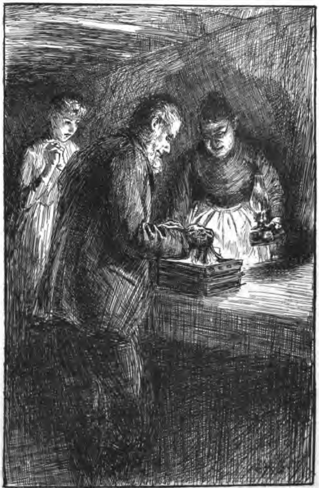
"IT WAS WITH A SHAKING HAND," ETC.